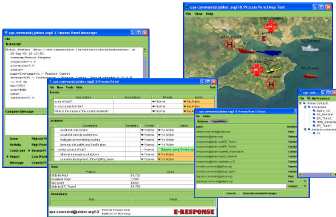
Figure 2. An I-X Process Panel, and its accompanying tools, shown here engaged in coordinating the response to a simulated environmental emergency.

In addition, to fully realise the C 2 aspect of FireGrid, it will be necessary to engineer knowledge-based support layers to, for instance, abstract the raw sensor data into meaningful concepts (e.g., “the central stairwell is on fire”) and interpret simulation results (“the ceiling of the central stairwell will collapse in 10-15 minutes”) so as to provide ‘intelligence’ for decision-making. Another key aspect will be the provision of suitable visualizations of this information, allowing for the most immediate communication of its content.