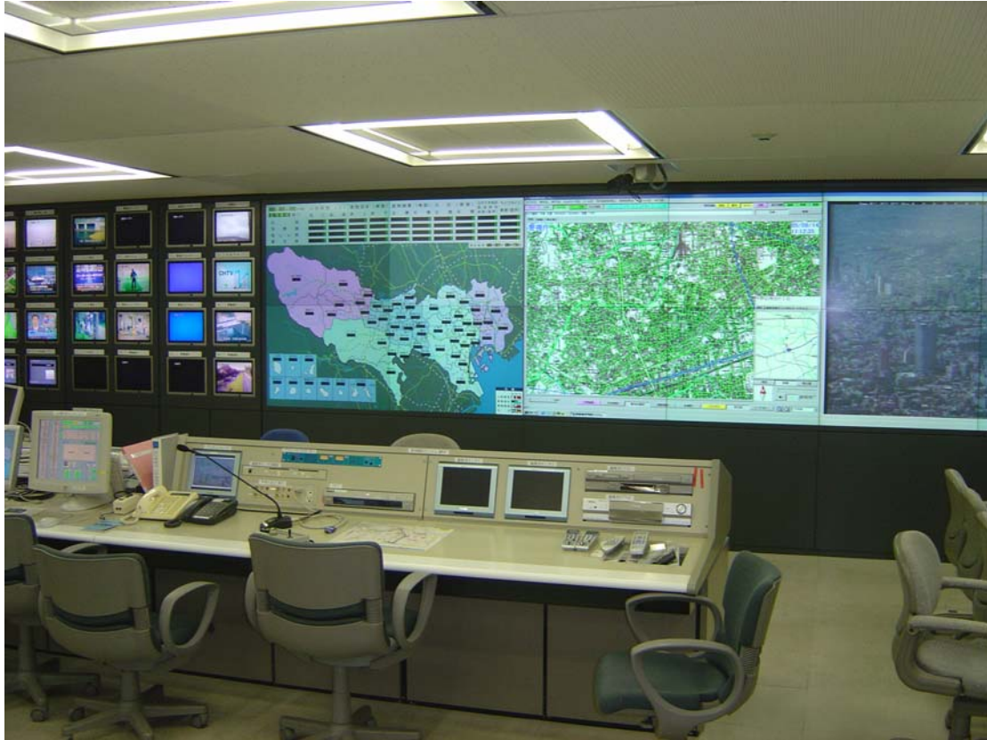
Figure 1: Typical Emergency Response Coordination Center – in this case, that of the Tokyo Metropolitan Government

Local or regional governments are often responsible for the event handling, planning, coordination and status reporting involved in responding to an emergency. They must harness local response capabilities to augment their own by calling on the resources of others when required. Figure 1 shows an emergency response center (this one for the Tokyo Metropolitan Government) which, in the event of an emergency, will provide information and support to the public (through emergency phone lines), to the responders and to the decision making authorities.