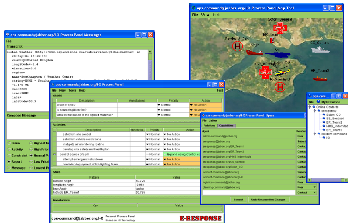
Figure 4. An I-X Process Panel, and its accompanying tools, shown here engaged in coordinating the response to a simulated environmental emergency

context and status of the agents and products involved (e.g. through emerging geo-location services for people and products). It also provides for the real-time communication of activities and tasks between both human and automated resources.