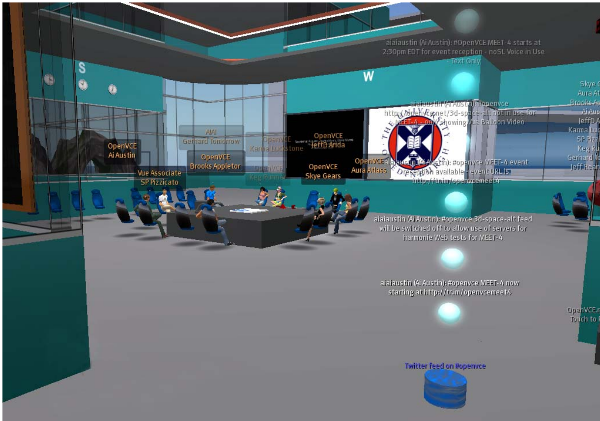
Figure 1- Sample I-Room showing information feeds and external agent links

I-Rooms have been in use since early 2008 for a range of collaborative groups, meetings and training exercises. Some I-Rooms are constantly available to their users through publicly accessible virtual worlds like Second Life™. 1